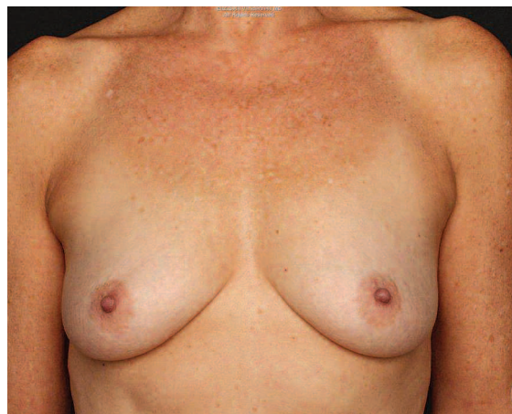
Figure 1 - Post three treatments.